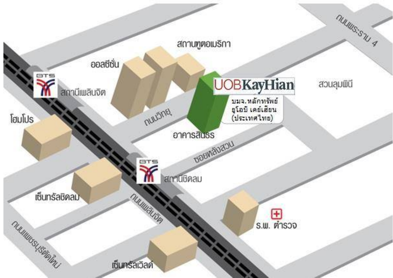
130-132 Sindhorn Tower I at 3rd floor Wireless Road, Lumpini, Pathumwan, Bangkok 10330